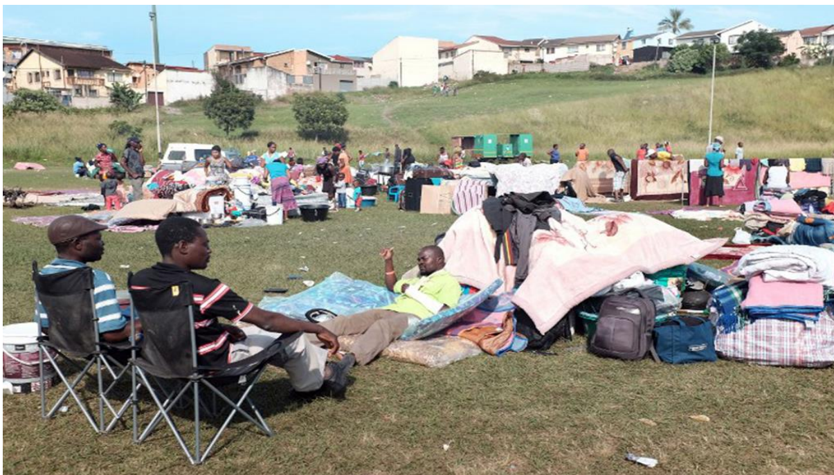
Figure 1. Displaced African immigrants sheltered at the Chatsworth football grounds south of Durban on April 10, 2015.

It is noteworthy that South Africans express their frustrations through protest marches. According to Dlanga (2011), black South Africans use protest marches to fight inequality; thus suggesting that they feel marginalized and ' when they are tired of being unequal, they will march and will destroy anyone's house in Sandton; it won't matter if it's a white or a black person's house..... ' And so, what seemed like a considerate South African welcome to all immigrant Africans suddenly turned into extreme hatred of those who had come to South Africa for the proverbial greener pastures. These African immigrants were precipitously labelled 'job thieves'.